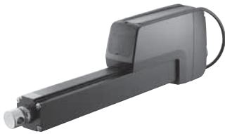
Thomson Electrak® HD Actuator Performance Testing Standards and Test Procedures v1.0